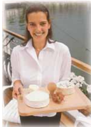
Cheese presentation is part of the pleasant mealtime routine

Victor Block is a freelance travel reporter from Washington, D.C.