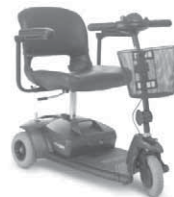
Go-Go Elite Traveller™