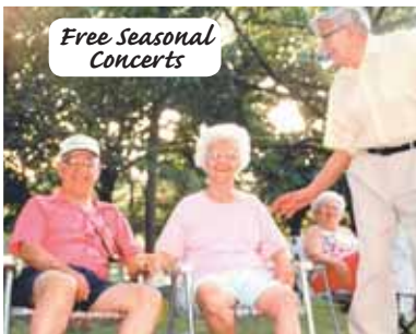
Free Seasonal Concerts