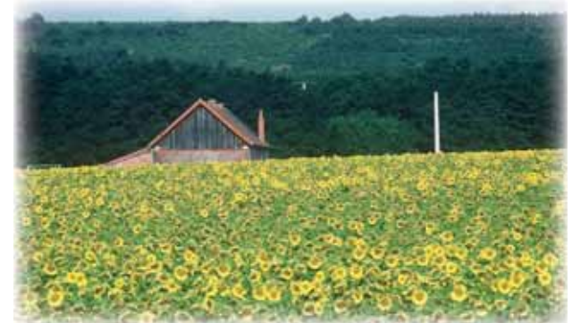
A field of sunflowers, just one scene that awaits passengers aboard the Horizon II in Burgundy.