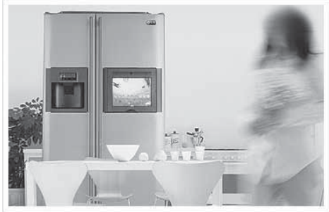
Kitchen: LG Electronics offers its TV Refrigerator with HD Ready LCD TV and Weather & Info Center.

And what home is complete without a robotic butler or maid? A few retail prototypes are in development, while the Massachusetts Institute of Technology last year introduced Domo, a robot that can grab and put objects away on shelves or counters. The model was for research only, but will help pave the way for retail versions — AP