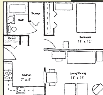
Comfortable floor plan