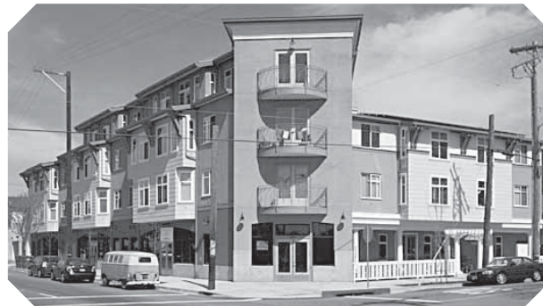
Sacramento Street Senior Homes, Berkeley, California

By using shared resources, smaller homes can be built, reducing their environmental footprint.