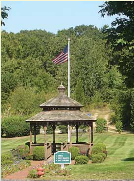
Relax in Park-like setting